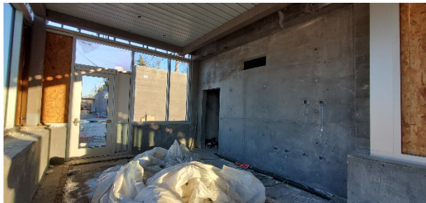
inside facing east