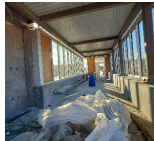
inside facing west