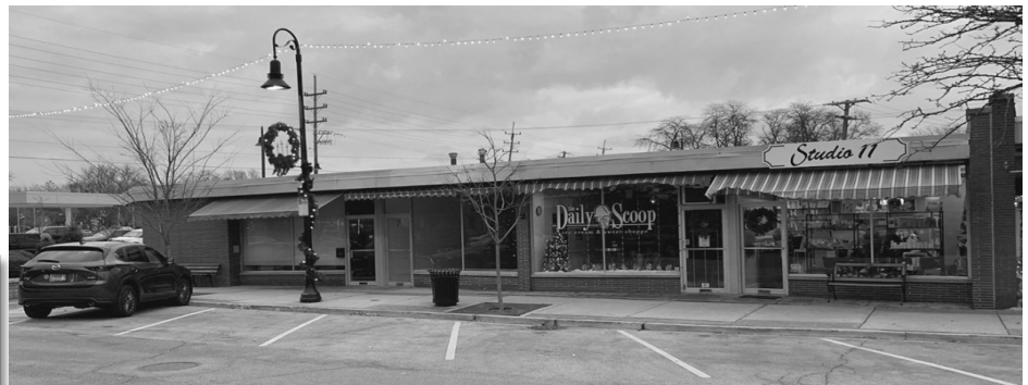
5-11 S. Prospect building (Former Coldwell Banker Realty office) property sold in 2022 . We look forward to a new business in the 5-7 S. Prospect Ave spaces.