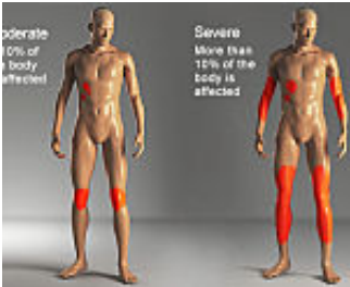
Moderate and Severe Psoriasis Treatment WebMD