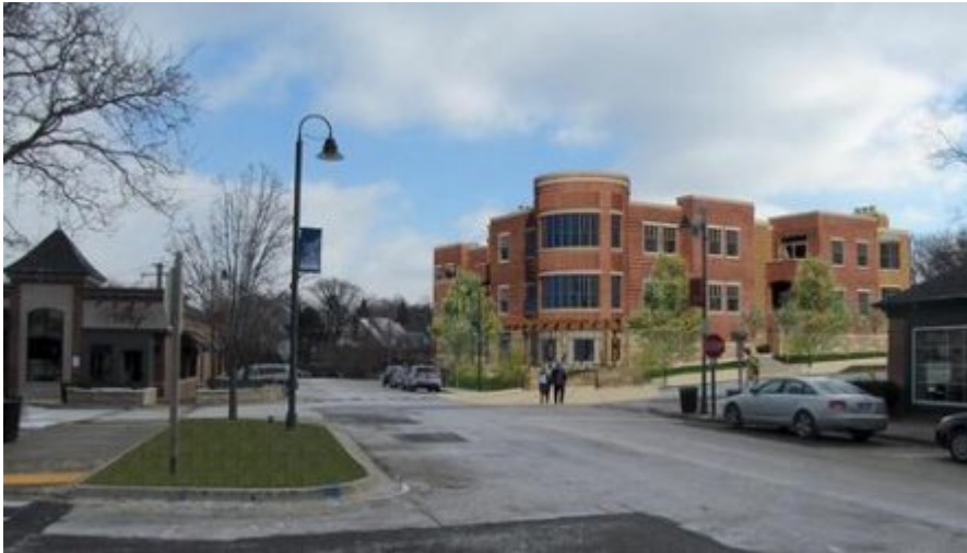
The Clarendon Hills Village Board approved first consideration of a proposed condo building that would stand at Prospect and Park avenues. (Provided photo)

CLARENDON HILLS – The Clarendon Hills Village Board unanimously approved first consideration of a proposed eight-unit condo development that would go at the corner of Prospect and Park avenues at Monday's village board meeting.