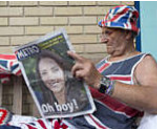
A Very British Proclamation NYTimes