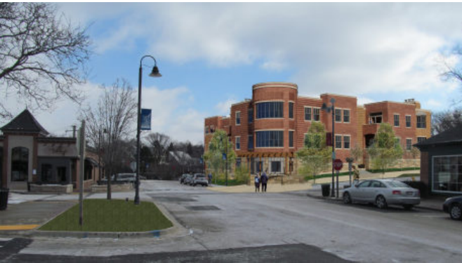
A rendering of the proposed eight-unit condo development at Prospect and Park avenues in downtown Clarendon Hills.

A plan proposing construction of a three-story condominium development in downtown Clarendon Hills went in front of village trustees for the first time Monday night and garnered a rather warm reception. 504