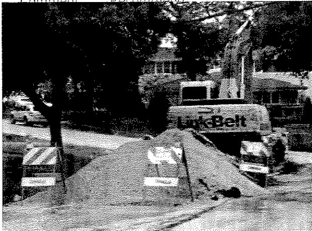
Watch the photo

The following is a release from the Village of Clarendon Hills: