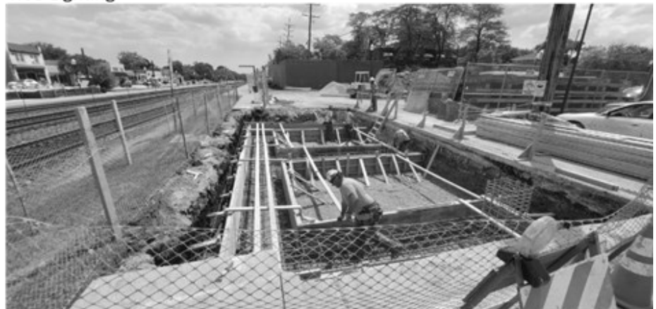
First Footing (inbound bicycle shelter)